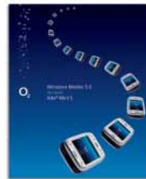
Microsoft Windows Mobile 5.0 – user guide