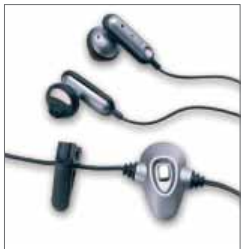
Hands-free stereo headset