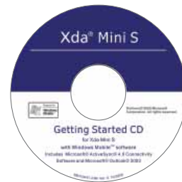
Microsoft Windows Mobile Companion CD – including ActiveSync and Outlook 2002