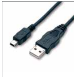
Connection cable – to connect your Xda to your PC