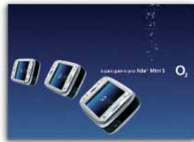
Quick guide – this booklet